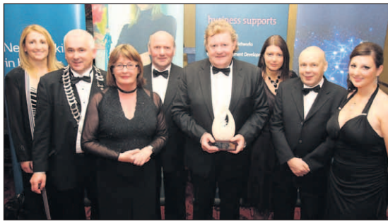
Edgewater College winners of Business to Business Award sponsored by Louth County Enterprise Board.

front development area, Edgewater College promote the town of Drogheda to major corporations, academic