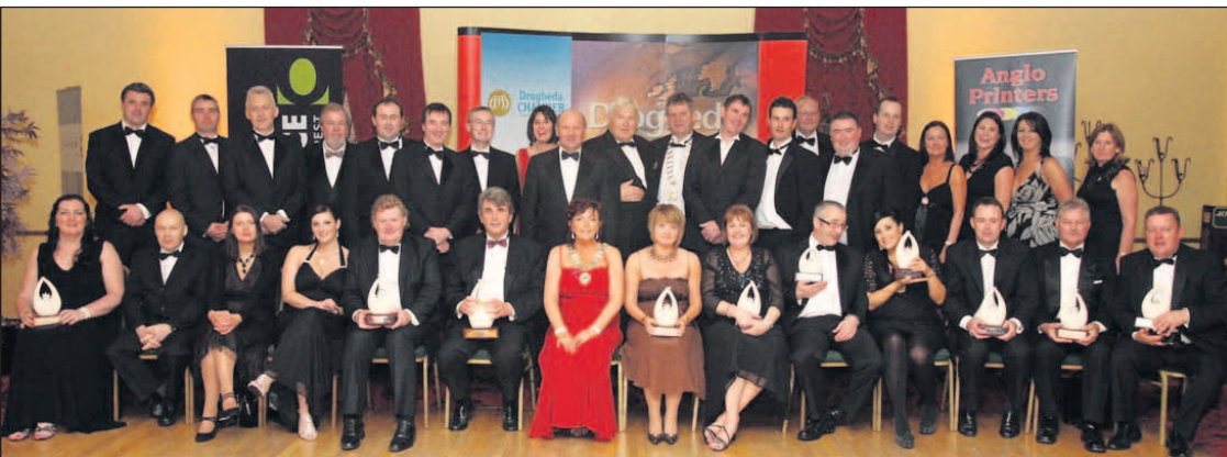
Award winners and sponsors at the Drogheda and District Chamber Business Excellence Awards in the Boyne Valley Hotel.

Constantly striving to predict and exceed clients' needs, Edgewater College provides the best business to business service in their industry. Edgewater College - Education for success.