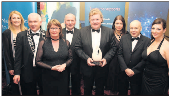
Edgewater College winners of Business to Business Award sponsored by Louth County Enterprise Board.

front development area, Edgewater College promote the town of Drogheda to major corporations, academic