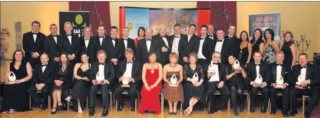
Award winners and sponsors at the Drogheda and District Chamber Business Excellence Awards in the Boyne Valley Hotel.

Constantly striving to predict and exceed clients' needs, Edgewater College provides the best business to business service in their industry. Edgewater College - Education for success.